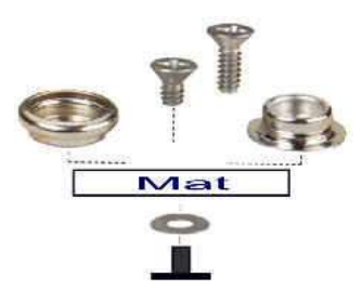
Figure 1, attachment of ground lug to mat

Note: we have predrilled holes in all 4 corners of the structure to accommodate these fasteners but they may be relocated to any place convenient to an AC electrical outlet. Drill first using 1/8" bit.