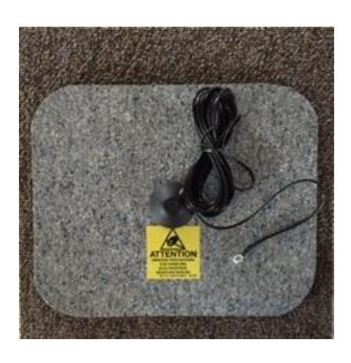
2) Place pad firmly on carpet and 3) step on each side to secure the Velcro Tab to the Carpet